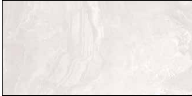
12x24 CLOUD IVORY HD PORCELAIN TILE 309-101(P)