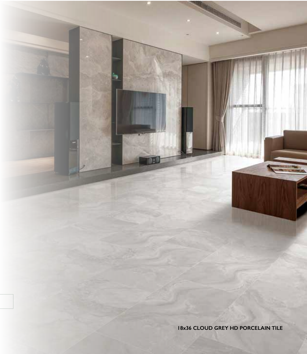
18x36 CLOUD GREY HD PORCELAIN TILE