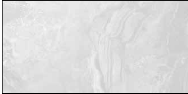
12x24 CLOUD GREY HD PORCELAIN TILE 309-102(P)