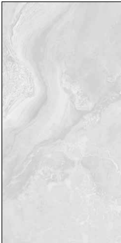
18x36 CLOUD GREY HD PORCELAIN TILE 309-104(P)