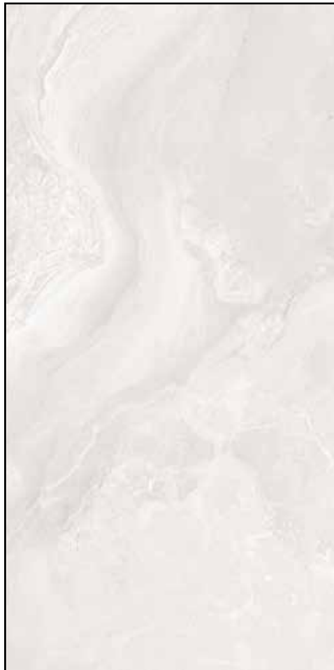
18x36 CLOUD IVORY HD PORCELAIN TILE 309-103(P)